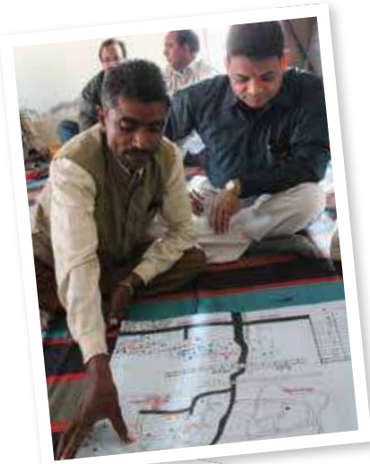
Top image: An Innovation: Village health and sanitation committees use a hand drawn map to plan how to reach every pregnant woman in the village.

A life-saving procedure or behaviour that has a proven direct biological benefit for the mother or newborn, e.g. cutting the umbilical cord with a sterilised blade to prevent the baby becoming infected.