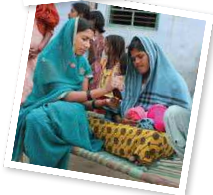
Bottom image: Interactions are enhanced by a mobile phone app innovation to support frontline workers in their work. Courtesy of IntraHealth's Manthan project, Uttar Pradesh © Agnes Becker/IDEAS.