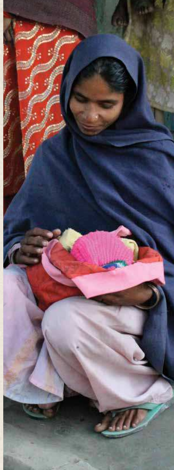
Image right: Mother with newborn, Atthasia village, Bahraich district, Uttar Pradesh.

Cover images (l-r) Frontline worker with mother and newborn, Uttar Pradesh, India Auxiliary nurse midwife health records, Uttar Pradesh, India Health records, Ethiopia Mother and newborn, Nigeria Health Extension Worker, Ethiopia Pregnant mother, Nigeria