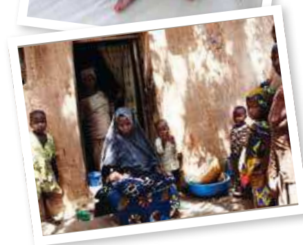
Top image: A premature baby lies in hospital © Bill & Melinda Gates Foundation.