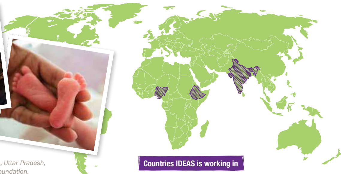
Image right: The size of a newborn babies foot can be used to determine whether it is putting on enough weight © Bill and Melinda Gates Foundation.