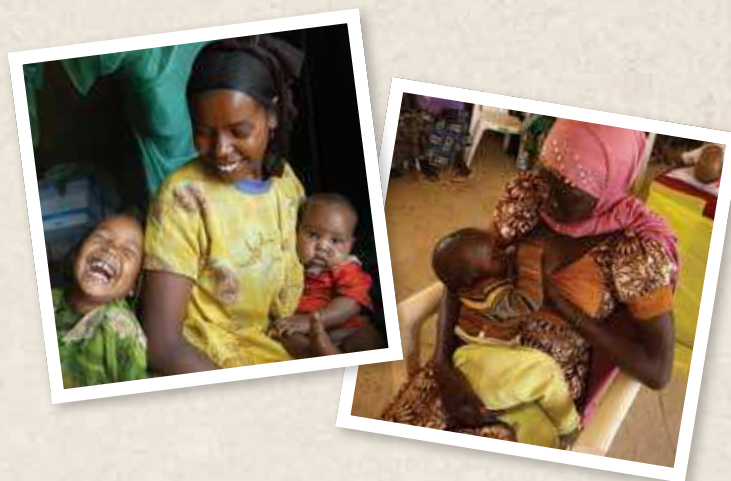
Image right: Life-saving intervention: Initiation of breastfeeding within the first hour of life, Nigeria

Image left: Mother with children, Ethiopia