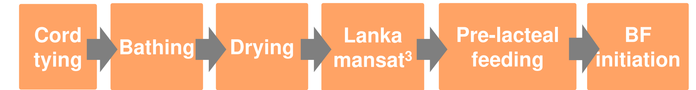
Fig 2: Sequence of newborn care practices following birth

Finding: There are other competing newborn care practices which have more cultural values to mothers